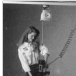
Automatic drum lock to secure load even if tension drops suddenly