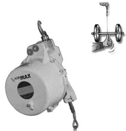
Load is secured by automatic drum lock even if tension drops suddenly